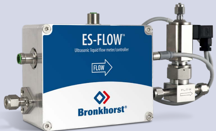
ES-113C/C21 Liquid Flow Controller