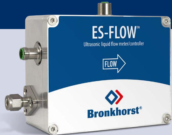
ES-113C Ultrasonic Liquid Flow Meter

Liquids can be measured independent of fluid density, temperature and viscosity, therefore recalibration per fluid is unnecessary. The flow meter has a straight sensor tube design with the actuators positioned at the outer surface. Therefore, the instrument is easy to clean. All wetted parts are made of stainless steel, build in an aluminium housing. The on-board PID controller can be used to drive a control valve or pump, enabling users to establish a complete, compact control loop.